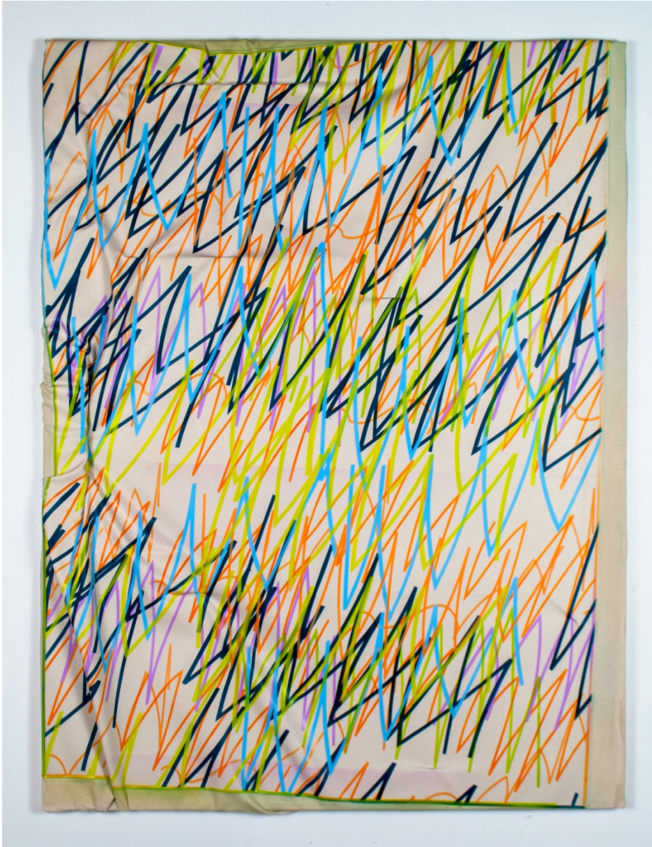
TIMOTHY HARDING, Adjustment II , 2020, acrylic on canvas, 48h x 36w inches

TIMOTHY HARDING IMAGES (also attached separately to email):