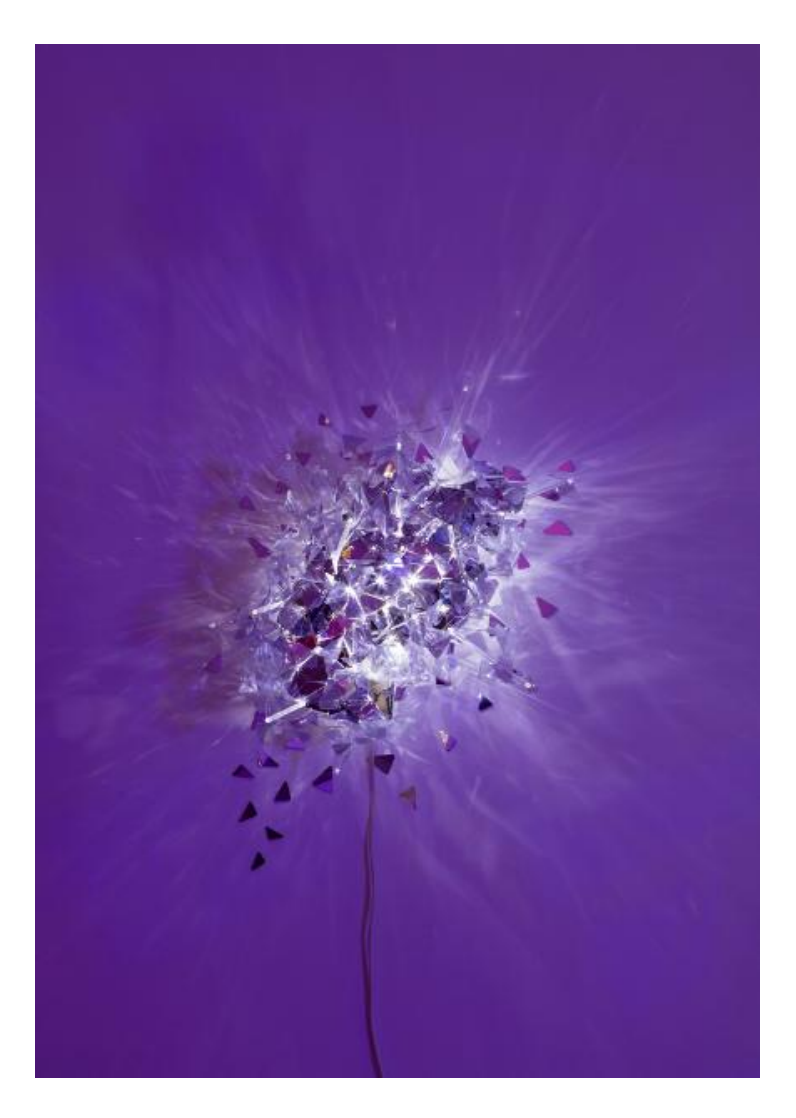
Surface Fusion, 2016, styrene, LED, Plexiglas 30 \times 24 \times 16 . Installed: 40 \times 28 \times 16

Though that might not be the case for her piece titled Poudretteite. The title of the sculpture is named after an extremely rare, pink material. Of course, the piece is pink and though abstract, still seems to reference a body or dress. I see a clearer picture that Andea is using this sense of opulence as something to tap into and explore. It feels positive and playful. I just can't decide if she is also pushing the boundaries between fine and decorative art or blazing a trail for abstract art. Either way, she has made me think about her show for weeks.