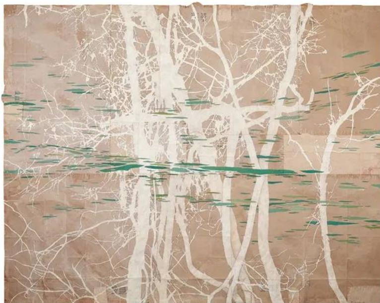
Sliding Beneath the Surface , gouache and thread on found paper, 48.75" x 61.75," 2014