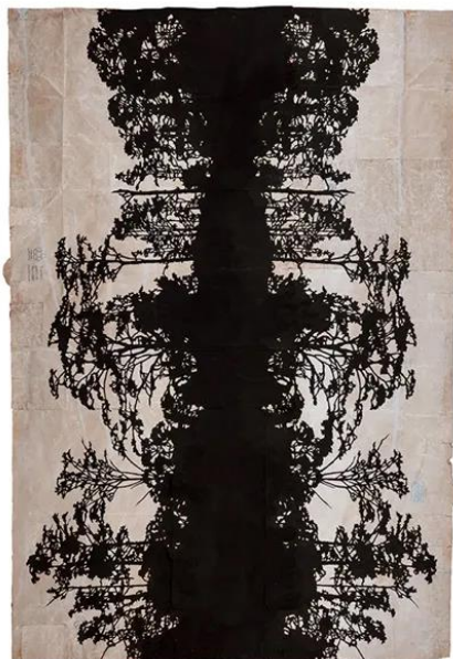
The Sea is a Body in a Thousand Ways , gouache and thread on found paper, 48.25" x 33.5," 2014