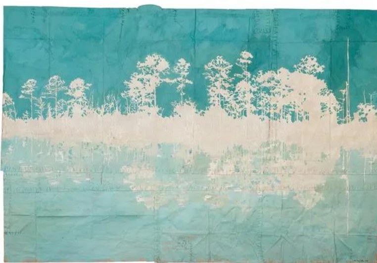
Shadow and Light , gouache and thread on found paper, 33" x 48.25," 2014