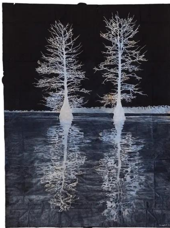
Ghosts on the Water , gouache and thread on found paper, 49" x 36.5," 2014