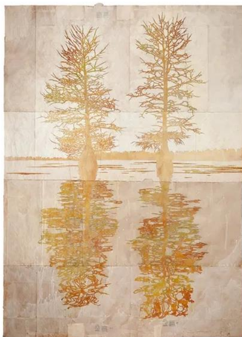
The Light that Traveled the Shore , gouache and thread on found paper, 66" x 47," 2014