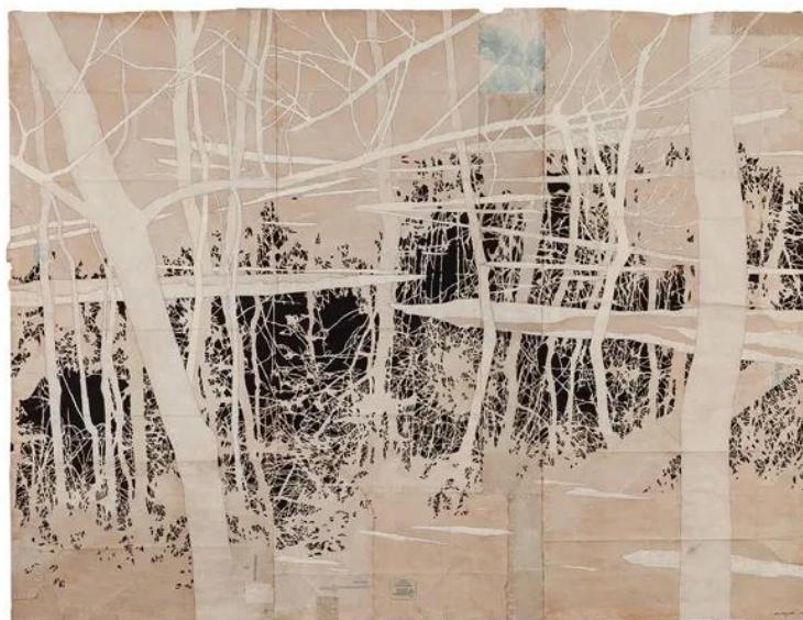
Drawn into a Deeper Shore I , gouache and thread on found paper, 48" x 63," 2014