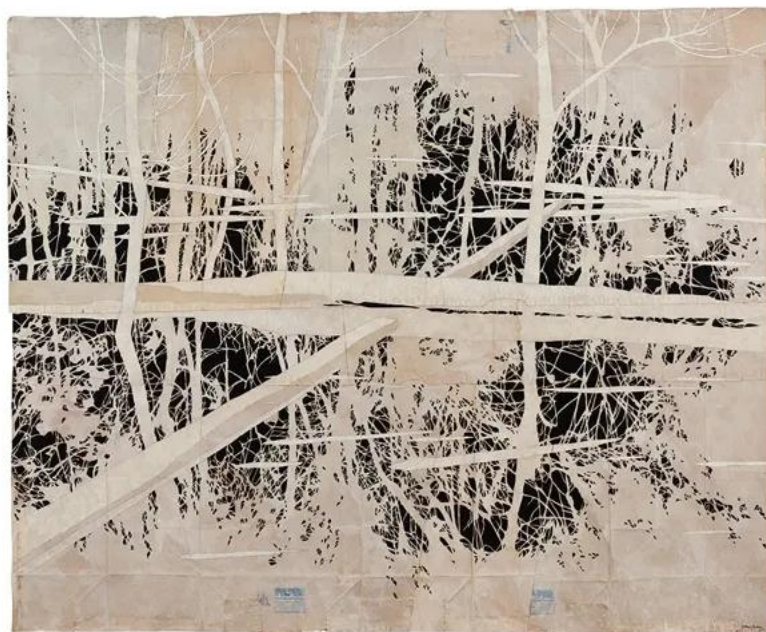
Between Two Shores II , gouache and thread on found paper, 45" x 54.5," 2015