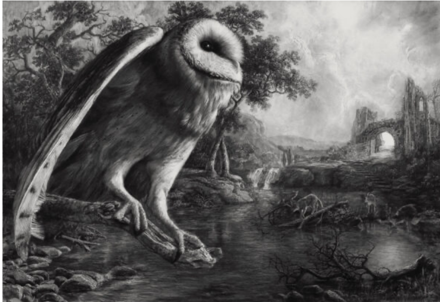
Tyler Vouros, "Jareth," charcoal and water on Fabriano paper mounted on canvas, 38 x 56 inches.

Glasstire counts down the top five art events in Texas.