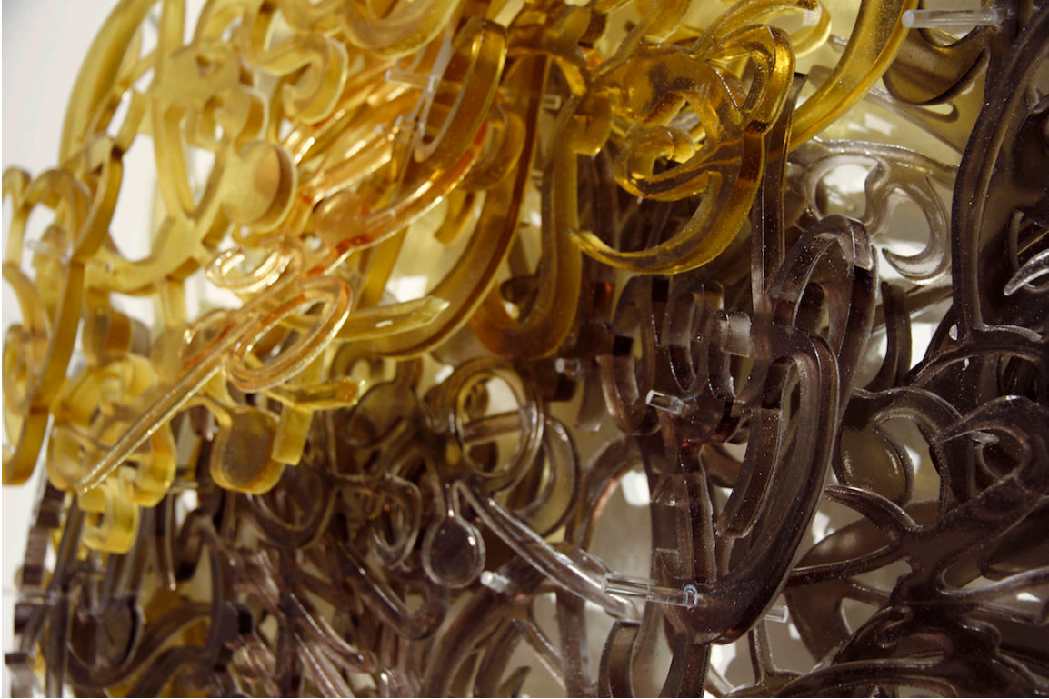
Simeen Farhat, Possibilities (detail), cast and pigmented urethane resin, 30" x 24" x 6", 2014 © Pentimenti Gallery

Pentimenti Gallery features content driven Contemporary Art which challenges traditional materials and aesthetics by a line of internationally established artists alongside young talent. Over time, the exhibition program has broadened to encompass abstract and figurative aesthetics to innovative works created from unconventional materials (packaging tape, marine vinyl, embroidered x-rays, etc.). Throughout two decades, Pentimenti Gallery has maintained a commitment to process based work and elaborate craftsmanship.