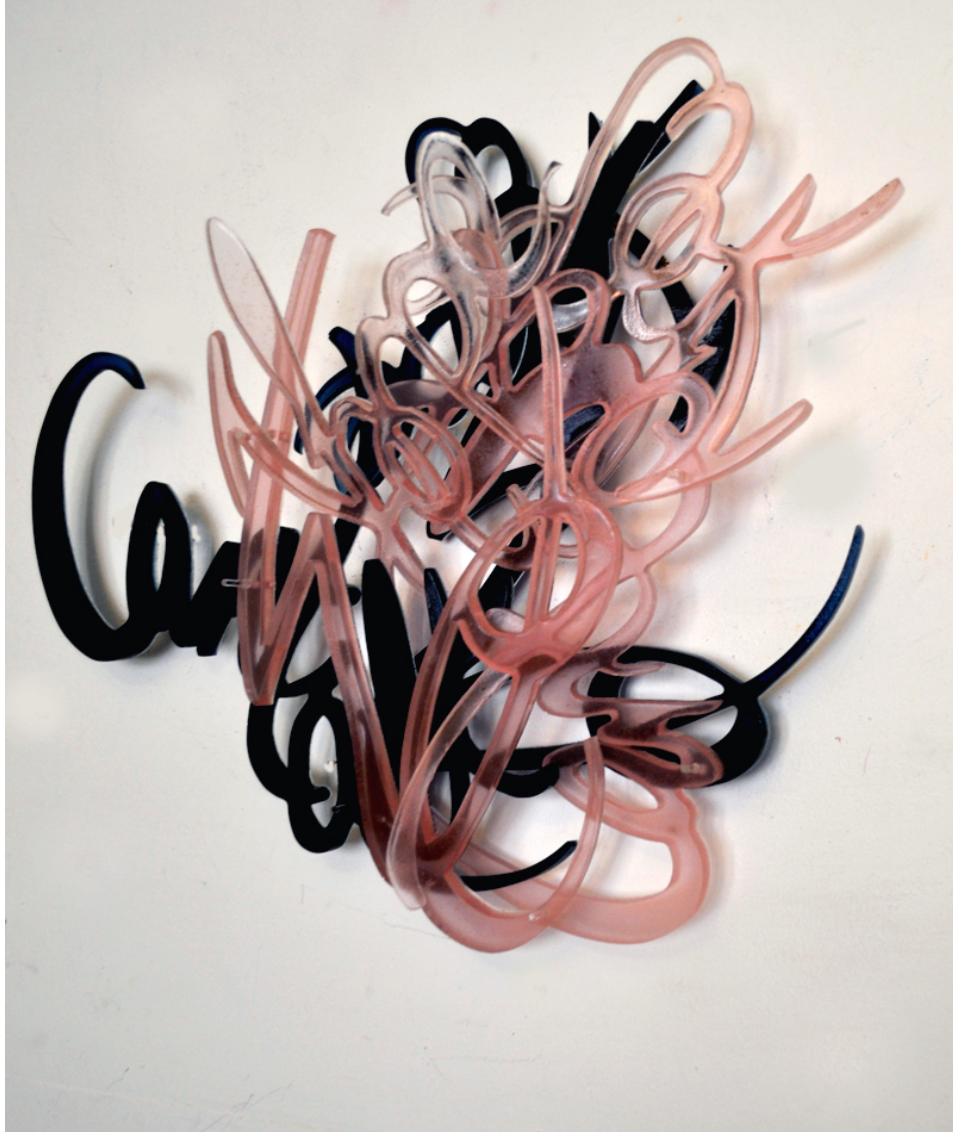
Simeen Farhat, Hope We Can Talk, cast and pigmented urethane resin, 16" x 19" x 6", 2014

As a visual artist, I do not follow the rules of any language; my intention is to reconstruct the thought process. Therefore, the text becomes self-contained and dynamic visual objects, whether borrowed from works of great poets and philosophers, or from the novel Alice's Adventures in Wonderland or from a common phrase. Although viewers may recognize familiar letters, words, or symbols from a particular language, the words in those artworks become indecipherable. My objective in choosing specific words is to show the essence of their message through abstraction, the overlapping of shapes and lines create tension and movement stirring up emotions.