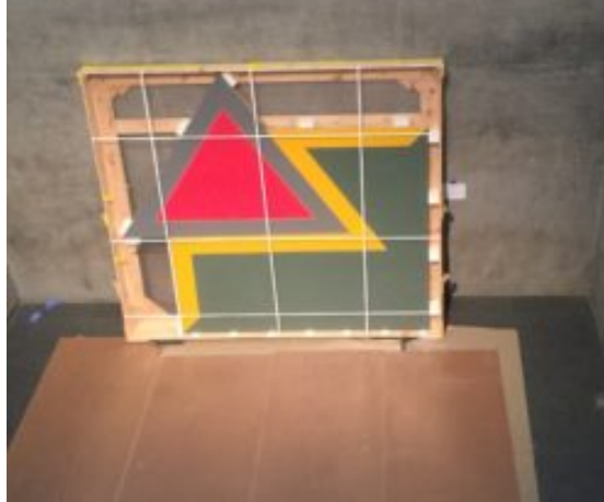
Frank Stella, Chocorua IV, 1966.

Skin is a series of nine acrylic-on-canvas grid paintings that are wrinkled surfaces protruding into sculptural 3-d shapes. Harding achieves these mangled and contorted forms in two ways. He either attaches painted strips of canvas to his surfaces and builds them up to create volume or wrinkles them, creating surface relief. The viscosity of the wrinkled surfaces, coupled with the gloss of the acrylic paint, suggests something entirely different from the minimalism the works aspire to. It feels more pop art than minimalism. It's as if the paintings were blown up pixels of a Roy Lichtenstein work.