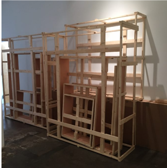
"What you see", Timothy Harding at Cris Worley Fine Arts, Dallas

A lot of painters eventually move away from the canvas and into sculptural installations. I think it's because when painting moved away from representation to abstraction, that space eventually became too small for the ideas that they wanted to express. The result is either entrenchment in those older modes or a straight up leap off the canvas. I think that migration away from flat surface paintings responds to many siren calls, but none stronger than the 3-d plane. When it is successful, it results in a more critical and engrossing experience with art.